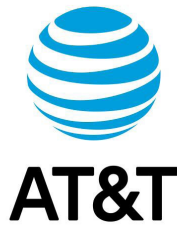
AT&T* 2,600 Employees